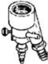
Mixing Head Complete